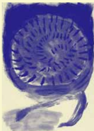
FROM THE SERIES / DE LA SERIE «TAI CHI» ABEL RASSKIN 2009